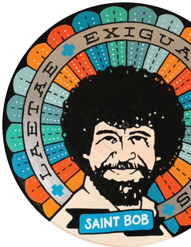
"Saint Bob" by Print Jazz, Remixed 5, 2017