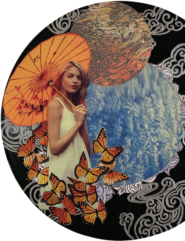
"Madame Butterfly" by Taylor Palacino, Remixed 7, 2019